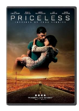
Movie viewing on Jan 29